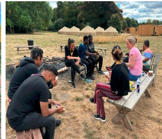
REACH Social Worker ISS & High Risk Coordinator RJ Victim Coordinator RO and Rep Coordinator

Caring for people, our places and the planet